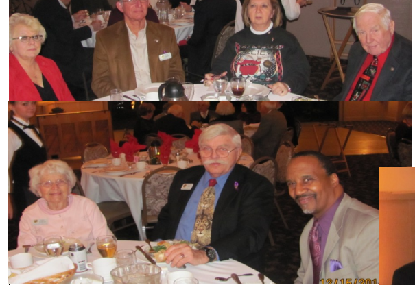
LION NEWS Page 3